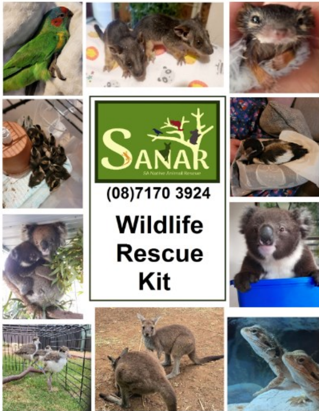
All Content © Copyright 2024 SA Native Animal Rescue (SANAR) Inc.